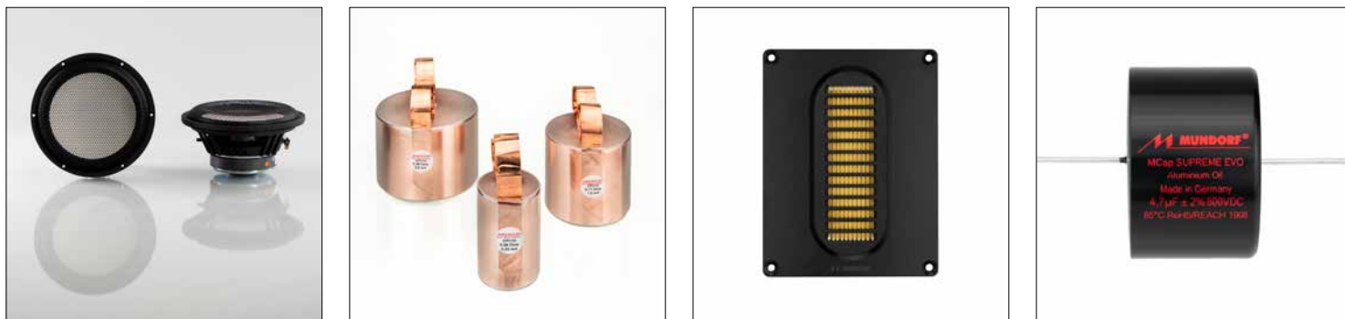
Like Oscar Wilde, Alpár Csendes is a man of simple tastes: he is always content with the best. The low-midrange drivers are all from Accuton, while the AMT tweeter and all crossover components, such as the foil coils and film capacitors, are from Mundorf's range-topping series.

— The two behemoths (delivered in five flight cases) were rolled into the editorial office by AdmiraVox founder Alpár Csendes and his team, and soon our listening room became one part high-end laboratory and one part car repair shop for the next few hours. Protective blankets were laid out, lifting devices put in position, and walkways cleared – you don't just casually set up these speakers. And once they are in place, you are effectively establishing a permanent fixtur. Weighing in at 125 kilograms per speaker – not including the stand – every move becomes a calculated action. The massive bases weigh an additional 25 kilograms each, and the external crossovers are nothing to sneeze at – 73 kilograms apiece. Every conceivable boundary has been deliberately pushed to the limit. Once the AV 170s are finally in place, they exude a presence far beyond their sheer mass. The name says it all: “170” stands for 170 centimeters in height, making the speakers anything but discreet even in large listening rooms. But regardless of this, they radiate an aura of astonishing elegance that belies their monumental dimensions. This elegance