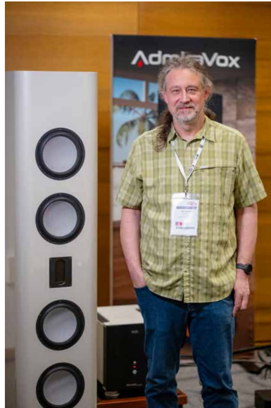
Our first encounter with AdmiraVox took place at last year's FINEST AUDIO SHOW in Vienna. The man-sized colossi were one of the big topics among visitors and impressed with far more than their sheer presence.

differentiated presentation of the individual string groups. The violins sounded smooth, with a silky mellowness that never tipped into sharpness, while the cello provided a clear woody foundation. The speakers truly opened up the room as an acoustic volume. Meanwhile, “Take a Pebble” by Emerson Lake & Palmer demonstrated the dynamic range of the AV 170. The transition between quiet, intimate passages and orchestral outbursts was mastered with ease. The intro grand piano had real body, and the strings and touch were crystal clear. When the drum rolls kicked, enormous energy was unleashed – but it never became unpleasantly loud. It was present, room-filling, impressive – but always perfectly controlled. Gianna Nannini’s “Profumo” demonstrated the speakers’ ability to convey deep intimacy. Her smoky voice, accompanied by just a few instruments, was palpable in the room, with a hint of reverberation enhancing the song. It is often voices with character that separate the wheat from the chaff – and the